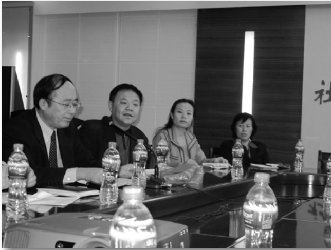
Representatives of the Academy talk to the students.