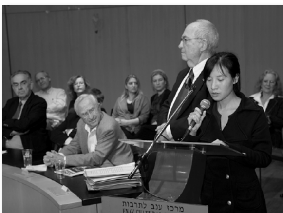
A representative of the Chinese students thanks the ICFS