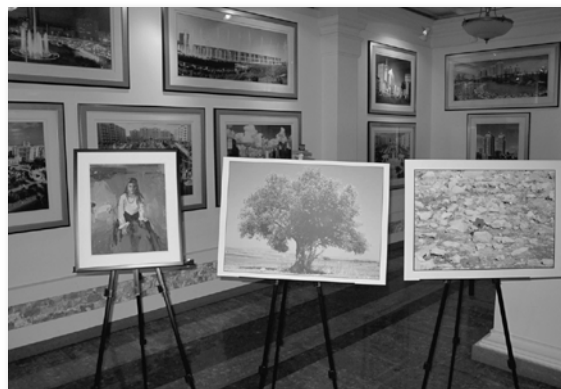
Photos of Israel