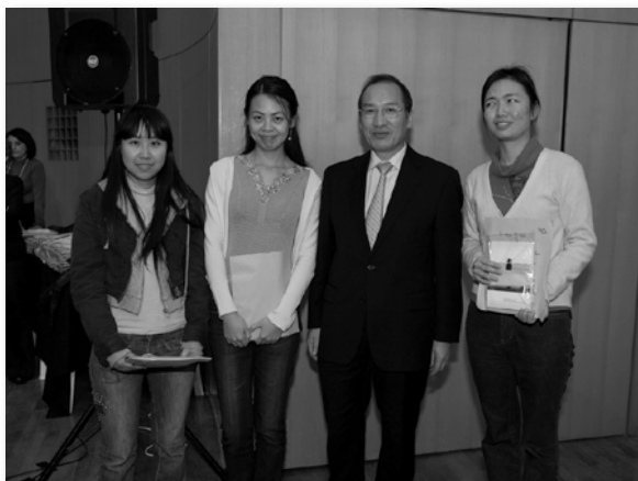
With the Chinese Ambassador in Israel