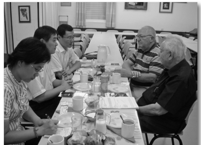
Meeting with the guests

Shanghai Jewish Refugees Museum 62 Changyang Road Hongkou District Shanghai 200082 CHINA