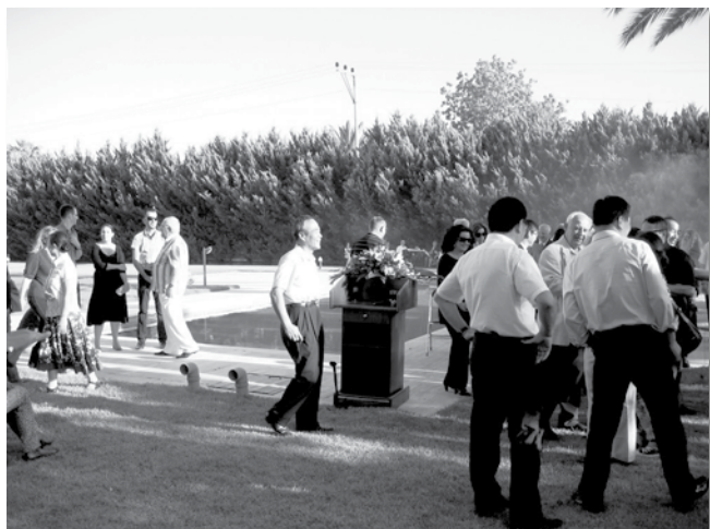
Countrymen coming to the reception