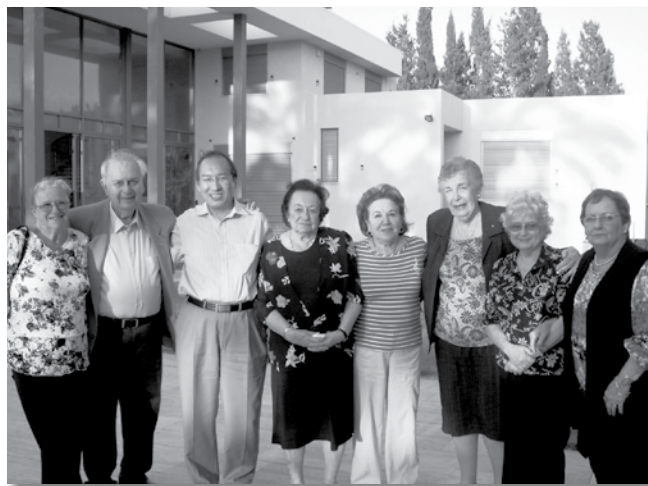
With China's Ambassador at his residence in Kfar Shmaryahu