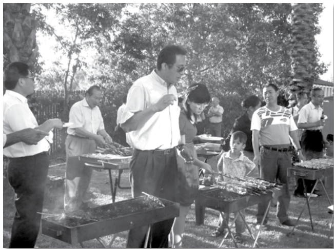
Entertainment was a success