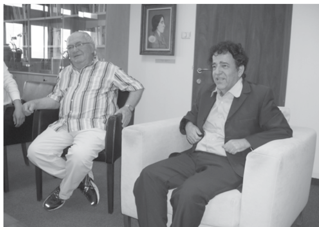
Meeting with the President of the University of Haifa