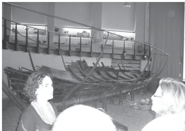
At the Hecht Museum in Haifa