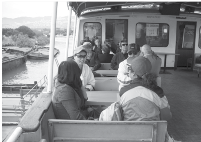
On board the boat in the Haifa Bay